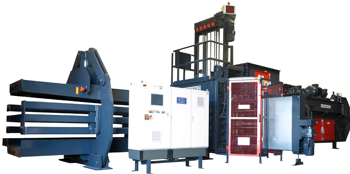
■ AVOS 2010 B5-150/170